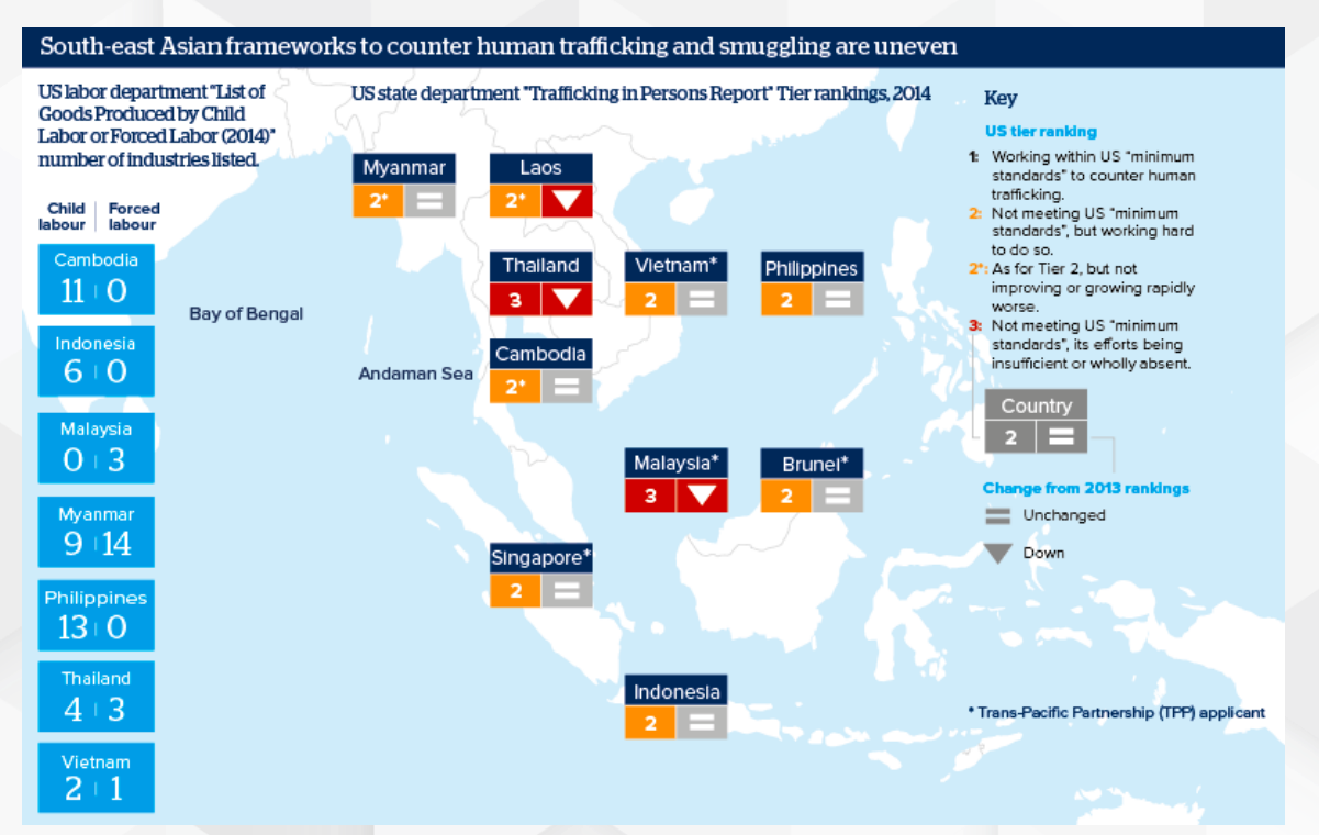
The United States Analysis on the Tiers of Each Southeast Asian Nation<sup>25</sup>

In Southeast Asia, nations generally understand the broad issue of child smuggling. Within this region, there lies a multitude of tiers that which countries are rated – tier 1 indicates successful exemplary willingness to combat the proliferation of child smugglers, tier 2 indicates progress, and tier 3 represents a lack in action and motivation to battle against the trafficking of children. Certain countries have more children smuggled out, and certain countries receive more of these victims. While essentially all southeastern nations have joined an NPA in the stand against trafficking, these countries have adapted to the legislations and guidelines in different ways.